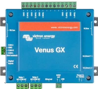
Venus GX with connectors