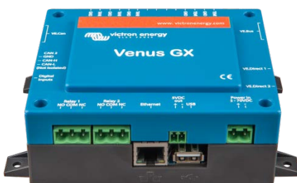
Venus GX front angle