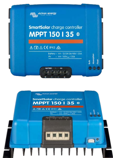
SmartSolar Charge Controller MPPT 150/35