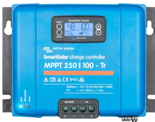
SmartSolar Charge Controller MPPT 250/100-Tr with pluggable display