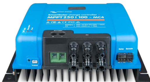
SmartSolar Charge Controller MPPT 250/100-MC4 without display