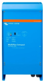
MultiPlus Compact 12/2000/80

When connected to the Ethernet, systems with a Color Control panel can be accessed remotely and settings can be changed.