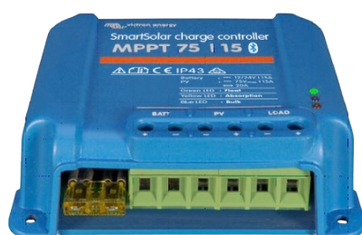
SmartSolar Charge Controller MPPT 75/15